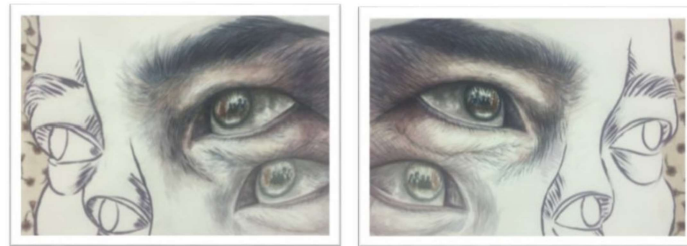
Figure 2: The left and right of Mom, 4 x 3 feet, Watercolour on paper, 2018

I could say that my trademark in my artworks has lines to shows the overlapping layer but for this artwork it does show the lines but not stand as overlapping technique. Plus, for this artwork there is a pattern at the background which rose flowers. Intentionally, I decided to do a same mode which not filled all the colours to the portraiture but only fill in colour in certain part. Looking at the light and dark tone has corporate well in one piece.