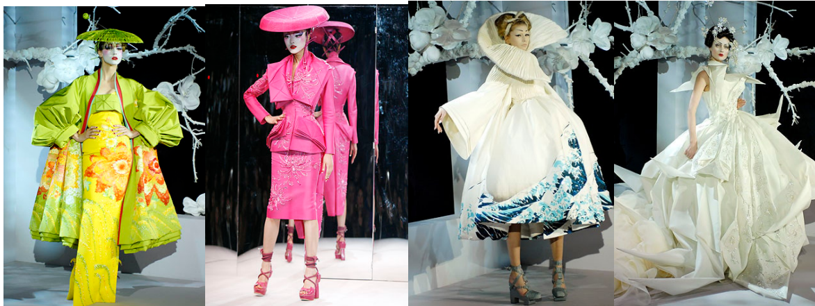
Picture 2: Cristian Dior Haute Couture by John Galliano 2007 Collection

John Charles Galliano or better known by the commercial name as John Galliano is a British fashion designer. Born in November 1960 and educated in Central Saint Martins, John Galliano worked with fashion designer who was the head designer one of French fashion company brands such as Givenchy in 1995 and in 1996 switched to the famous Haute Couture Fashion House Christian Dior. Galliano now serves as creative director for fashion house Maison Margiela. Galliano achievements has been named awarded the British Fashion Designer of The Year four times. In a 2004 British Broadcasting cooperation (BBC), he was named the fifth most influential person in British culture.