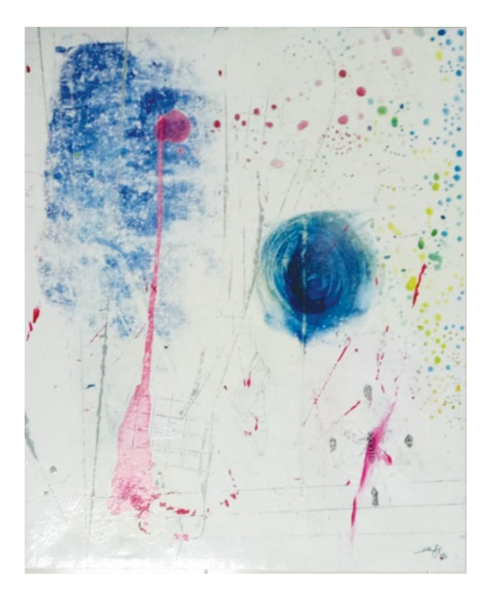
Figure 5: "Free Memories", Mixed Media on Canvas, 2020, 79cm X 94cm

The blue color was placed in an "asymmetrical balance" to demonstrate the contrast on the white background. Hot colors such as red and yellow were used to indicate emphasis. Lines were inserted randomly but in a controlled manner. The image of the cocoon cycle was also included in the production of the artwork.