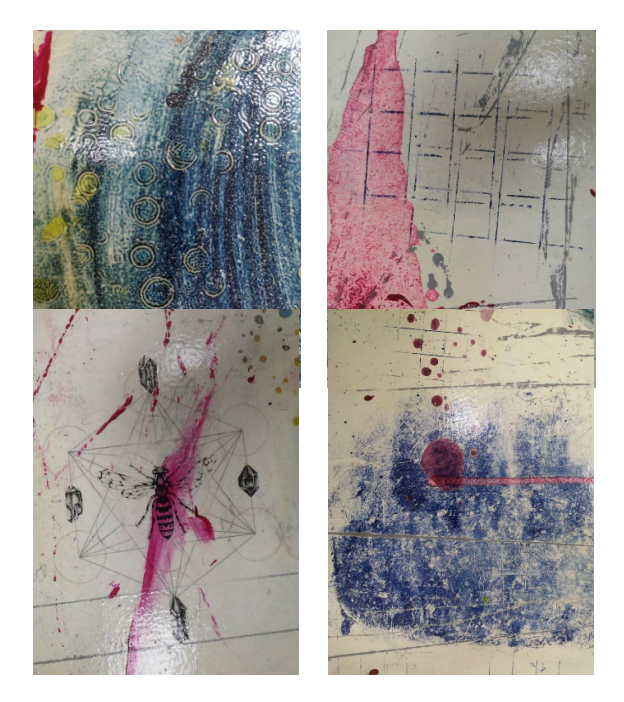
Figure 4: Detail of artwork "Free Memories"

The blue color was placed in an "asymmetrical balance" to demonstrate the contrast on the white background. Hot colors such as red and yellow were used to indicate emphasis. Lines were inserted randomly but in a controlled manner. The image of the cocoon cycle was also included in the production of the artwork.