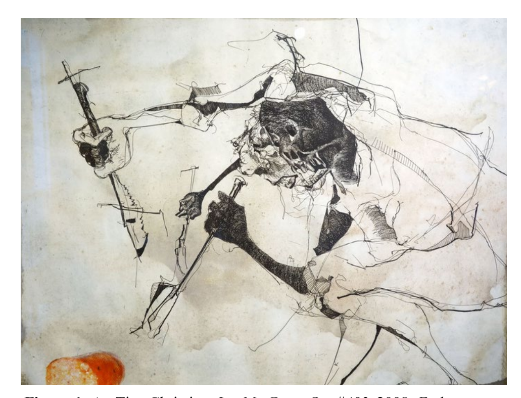
Figure 1: Ay Tjoe Christine, Let Me Come Out #403, 2008, Etching, drypoint, atas Kertas, 80cm x 60cm.

The selection of this artwork as a reference work for the author is used to refer to the style of presentation that is highlighted. This artwork shows a style of surrealism with a rather confusing presentation of images. The author is interested in the use of line quality variations which are produced casually but they produce an interesting impact on the image of the artwork. A figure can be seen where the character is trying to dig through the wall to find a way out. Referring to the title, the title "Let Me Come Out # 403" clearly depicts the meaning of the story of the drawn image which is presented. The author finds the use of the "mark-making" technique as a background for the artwork. The understated mark-making is clearly visible without adding other images.