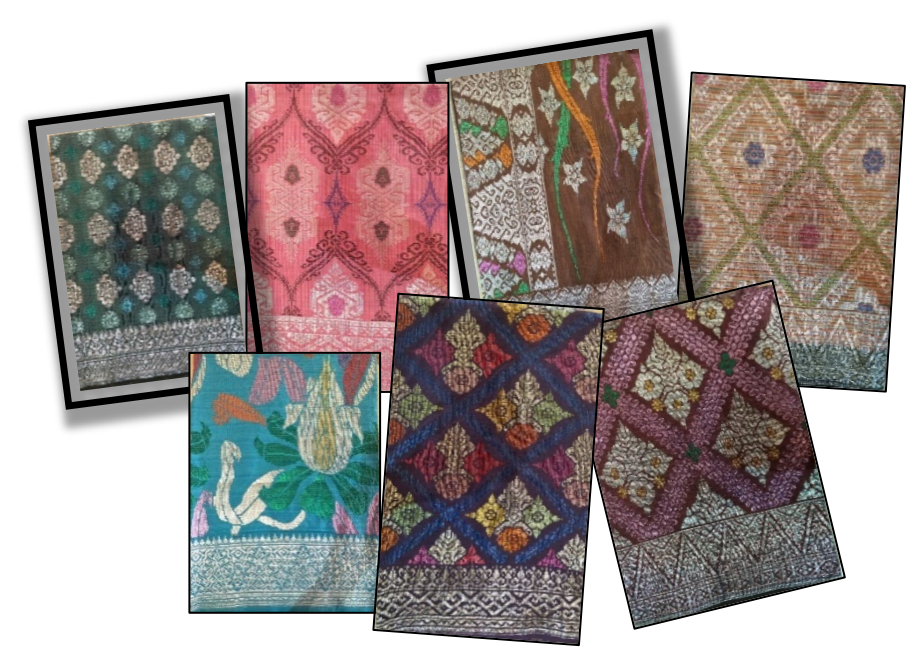
Figure 8 : Collection of Songket , in seven different colour and motif collect from several informants.

In a nut shell, the use of Songket 'queen of textile' is very dominant for the royal family not only on the head shaving ceremony, also use to most of their custom and tradition ceremonies. They up bring the uses of Songket and also, they preserve these precious Malay own heritage.