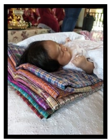
Figure 4. A baby laying on a baby bed underneath seven layers of Songket, during her head shaving; cukur jambul ceremony, 2018, (Source: photo taken by researcher)

A Study on Children Customary Clothes in Malay Head Shaving - Cukur Jambul Ceremony for The Malay Royal Tradition