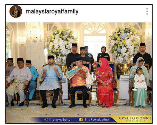
Figure 7. Picture of Johor Royal family during the Head Shaving; cukul jambul ceremony; berandam surai for their grandchildren (2018)