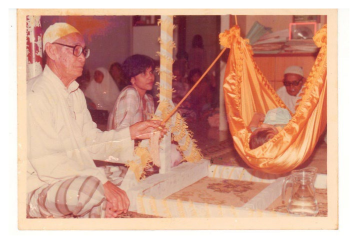
Figure 1. Malay custom of adat naik buai / berendoi / cukur jambul of her son and daughter in 1986.

(Alhady, 1962), (Mohamed, 1995), (Alhady, 1962)