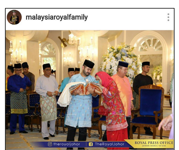
Figure 6. Picture of Johor Royal family during the Head Shaving; cukul jambul ceremony; berandam surai for their grandchildren (2018)

Figure 5 . Baby Zaheerah hold by her mother on the seven layers of Songket , and her aunty holding the Head shaving: Cukur Jambul apparatus during her day, 2018