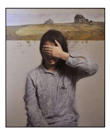
Figure 5. Sometimes by Closing Your Eyes You Will See More Clearly after Andrew Wyeth, Acrylic and Oil on Canvas, 244 x 198.5 cm (2019)

Grey is also often seen as a "colourless" hue since it is not the favoured hue for evoking emotions, particularly joyous ones. The majority of Hazri's paintings have a combination of hues, notably in the backdrop. Hazri uses grey to portray memories of the past, bygone personalities, and melancholy. The two homes on the hill in the backdrop of his translation of Andrew Wyeth's art recalled recollections from his childhood. Because the backdrop directs the feelings of the people in his artwork, the grey in the background has the greatest influence. For him, memories of the past are as hazy as fog, dust, and puffs of smoke, as if we were searching for a weak light.