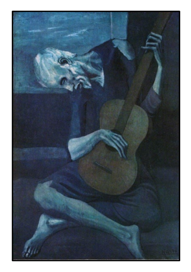
Figure 1. The Old Guitar, Pablo Picasso (1903)

There are three categories of colours in art: cold colours, warm colours, and neutral colours. Cool hues (green, blue, and purple) are often associated with a sense of serenity and harmony, yet they may also trigger sad thoughts and despair. Because it is connected with natural elements such as water and the sky, blue is often seen as a tranquil hue. However, it may also evoke a sense of sorrow or seclusion, as in the works of Pablo Picasso created between 1901 and 1904, which reveal the artist's inner melancholy via the use of blue and blue-green monochromatic hues.