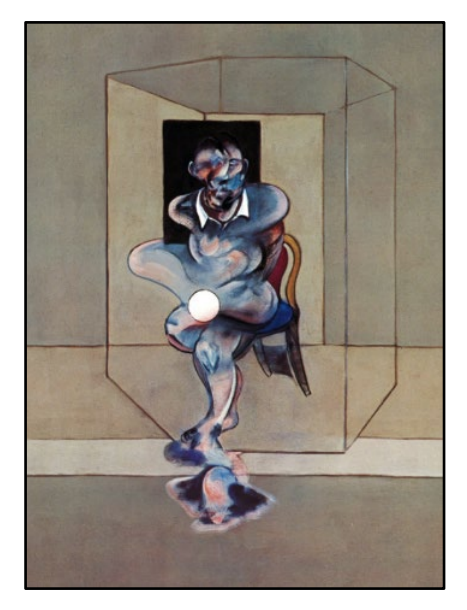
Figure 4. Francis Bacon, Study of Self-Portrait, Oil paint on canvas (1976)

The Notion of Collective Identity was developed for a touring exhibition of contemporary Chinese art at the Chinese Art Centre, Manchester, and the University of Hong Kong Museum and Art Gallery, Hong Kong, curated by the author in 2007