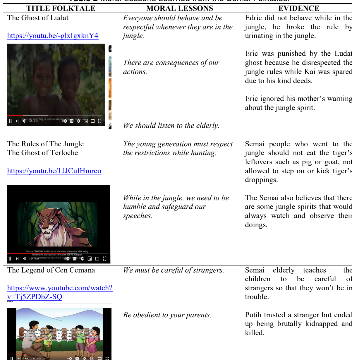
Table 2 Moral Lessons Learned from the Semai Folktales.