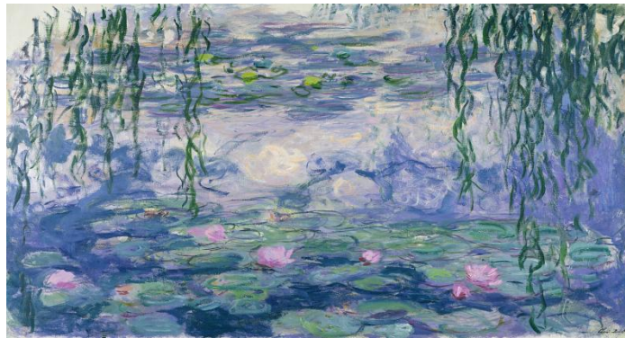
Figure 4 Water Lily series

Monet once confessed to a studio visitor: "It took me a little while to get to know my water lilies. I started purely for the pleasure of the eye and never thought to record them with a paintbrush. However, the landscape gradually became ingrained in my bones. It was as if I had a sudden awakening and realized the beauty of the lily pond in front of me, so I picked up my palette and painted. From that moment on, I painted almost nothing new."