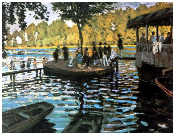
Figure 1 Frog Pond Island, 1869

Renoir and Monet visited Croissy's Frog Pond Island in 1869 to sketch. One of Monet's paintings, "Frog Pond Island", depicts a ROWING cafe with the slogan "ROWING-BOATS FOR HIRE" and an island with a small tree called "Pot" (also known as "Camembur"). There are two footbridges on the island, one leading to the cafe and the other to Cloissy Island, both of which are used by tourists.