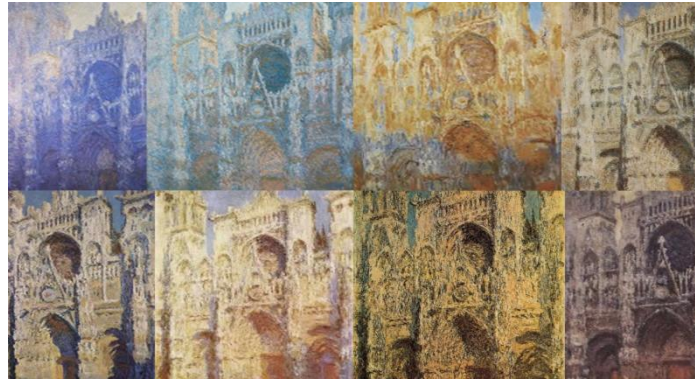
Figure 3 Rouen Cathedral series

Monet started his Rouen Cathedral series in February 1892, following the classic works of the Haystack series in 1888 and the Poplar series in June 1891. Rouen Cathedral, located in the city of Rouen in Normandy, France, is a medieval Gothic masterpiece that has stood for centuries as a symbol of religious piety and architectural brilliance. During a visit to Rouen in 1892, Monet was fascinated by the interaction of light on the facade of the church building, which inspired him to create more than 30 paintings.