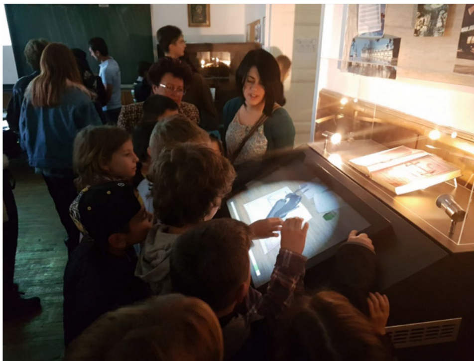
Figure 2 A 3D-augmented book titled Constitutio Criminalis Theresiana (Nemesis Theresiana) .

Modern approaches such as interaction design incorporation, interactive storytelling, and artificial intelligence could direct a new paradigm for museum experience design (Dal Falco & Vassos 2017; Vermeeren et al., 2018; Harada et al., 2018). The use of human-computer interaction for museum artifacts can offer a unique interactive and storytelling experience (Zidianakis et al., 2022; Benko et al., 2016). When AR replicas were visualized in real time, visitors could interpret historical figures through narrative-based setups (Rizvić et al. (2021). This study agrees that augmented museum exhibitions together with supplementary information could contribute to creation of an 'animated archive of cultural materials' (Patti.,2020) (refer to Figure 2). In the same vein, this initiative could catalogue objects alongside their descriptions and identify multiple representations of the same artifact.