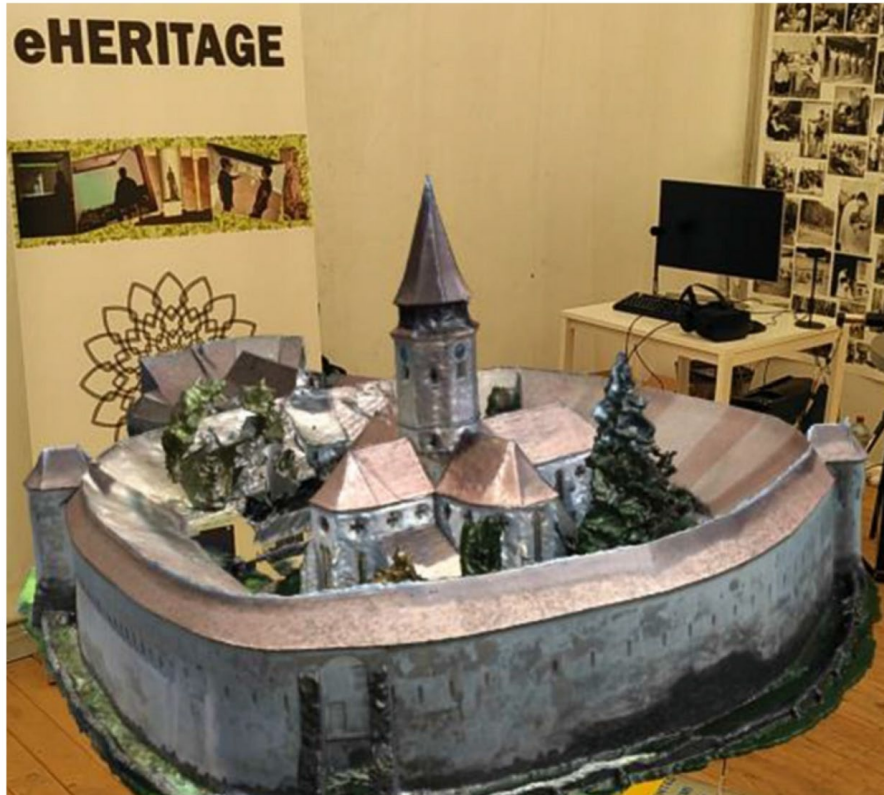
Figure 3 The example of 3D reconstructed Prejmer Fortified Church, a UNESCO monument from Transylvania, Romania.

For instance, AR is applied in the restoration of damaged sacred objects, contributing to the rejuvenation of these culturally significant heritage artifacts (Boboc et al., 2017). It aids in determining the most effective restoration strategy to create a precise replica, thereby reducing costs and expediting the restoration process. Through the use of 3D reconstruction technology, a digital model of the damaged object can be generated (Parfenov et al., 2022) (refer to Figure 3). Subsequently, the optimal restoration strategy is identified by implementing an AR application developed based on this digital model (Abate et al., 2018; Blanco-Pons et al., 2019). Despite its advantages, augmented reality technology encounters challenge due to the lack of clear guidelines on its utilization. Another substantial obstacle to the widespread adoption of AR technology in the reconstruction process is the limited experience with AR applications.