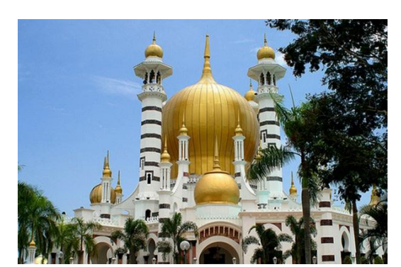
Figure 1: Masjid Ubudiah in Kuala Kangsar (Extracted form Laman sesawang Majlis Perbandaran Kuala Kangsar)