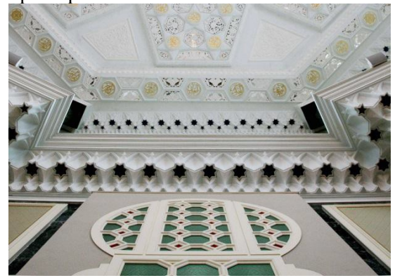
Figure 2: Fine Art Architectural Photography I

Fine art photography is one of the genres in photography fields. However, in architecture photography, fine art is more on the style. Thus, it allows photographers who have a creative mind to produce images of architecture Masjid Ubudiah using fine art approach. The imagination of a photographer is needed to digest an idea about architecture photography and to shape it into a work of creative and aesthetic. Documenting architectural heritage of Masjid Ubudiah through fine art approaches plays an important role in delivering a message to viewers, how beautiful the architecture Masjid Ubudiah in development of a visual identity for future generations. The great of visual become the most powerful medium to give an impact in visual communication and a mode of visual impressions. Besides that, it can help to build knowledge among viewers, which is shown in photographs that portray the diversity of elements and principle of art.