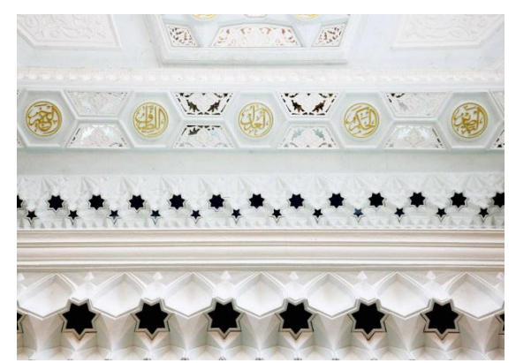
Figure 4: Fine Art Architectural Photography III