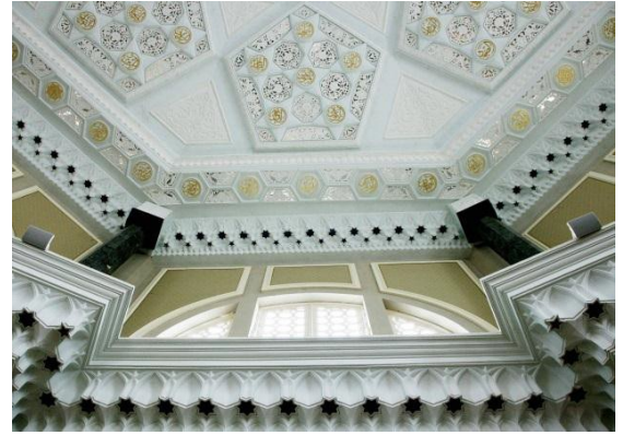
Figure 3: Fine Art Architectural Photography II