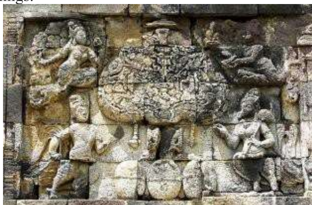
Figure1: Hayat Tree Motif from Kalimantan (Source: Ornamen Nusantara – Kajian Khusus tentang Ornamen Indonesia, 2009)

Here is an example from the thesis of Literature Faculty at Gadjah Mada University in Indonesia, about Kalpataru's Ornament at Buddhist Temples in Central Java. Kalpataru tree or in other word 'Kalpawaksa' or 'Banyan Tree', is a famous mythological tree in Indonesia. Based on the mythology, this tree has a green leaf, with the beautiful flowers and aromatic fragrant, and have a lot of gold chains and pearls that hangs up at the branch. Kalpataru in Sanskrit language is 'Life Tree'. In the prehistoric era, animism and dynamism faith were popular. They believe that some trees have a magic power that becomes a source of life and grants the entire human requests. The Indonesian predecessors have used the Kalpataru's carvings for the depiction environmental compatibility, harmony and balancing of forest, land, water, air and living things.