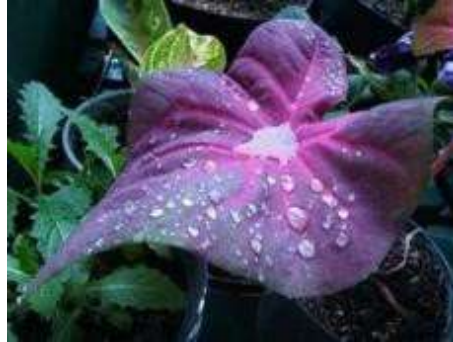
Figure 4: Caladium Leaf Shape

The prominent character of tropical leaves is in their width size, wavy surface and spread leaves. When the wind-blow, we can see the flexibility of leaves and we can catch the new beautiful shape.