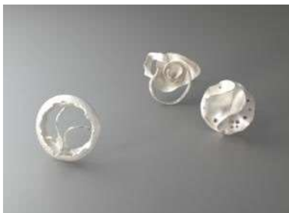
Work 2: Tropical Flower I, II, III Brooch, 55mm x 60mm x 28mm, 66mm x 66mm x 18mm, 55mm x 57mm x 25mm, 92.5% silver, cubic.

The tropical climate is such a ‘heaven’ for the growing plant. There is a lot of flower species that have a beauty and unique shape. These set of jewellery is a depiction of some tropical flower in my native country. To express the wavy rhythm, I used soft clay and casting it into silver. I also put some texture with roll printing to catch the natural image.