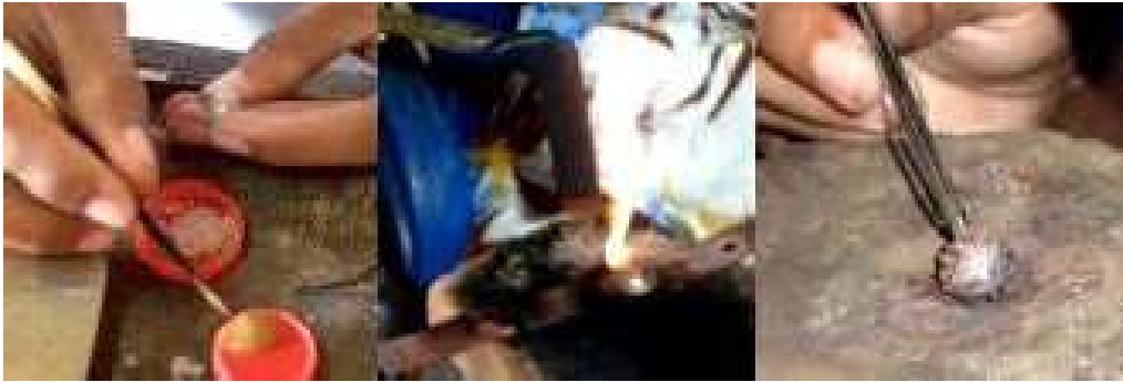
Figure 10: Granulation Process