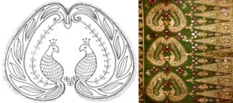
Figure 3: Peacock as a Textile Motif

In another Indonesia mythology, all species of bird are representing upper world. As we know, the upper world is a depiction of supernatural world, spirituals world, gods, sky and heaven. Until now Dayak tribe believe that hornbill is used as a conductor (vehicle) of their ancestor or as a depiction of their ancestor who fly to heaven, and as a symbol of loyalty. There is also a mythical bird that represents bravery and heroism. The bird is called garuda. In Hindu's faith, Garuda was a vehicle of Visnu (Hindu's God); therefore, Garuda is known as a supernatural and sacred bird. Garuda also is use as Indonesia nation symbol.