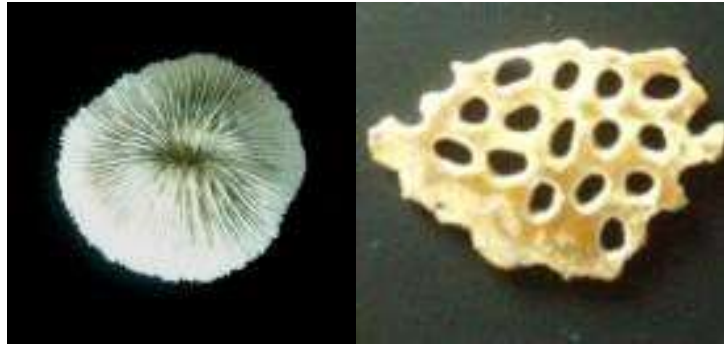
Figure 8: Filigree Process