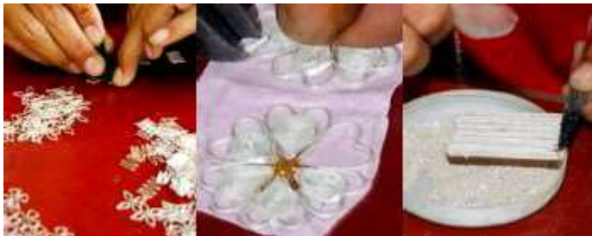
Figure 7: Caryophyllia spp & Fossil Coral

Especially, coral reefs are most commonly live in tropical waters. The character is colorful, very organically line and natural shape, also had a lot of hole (cavity). The famous coral in Indonesia is fossil coral. Their shape was very natural, their whole, line and structure is formed by the water movement in the sea.