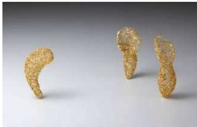
Work 7: Form Transformation I, II, III Brooch 110x30x33, 98x45x35, 50x90x32mm Copper Wire, 24K Gold Coating.

I decide to combine the coral reefs image by using the carophyllia spp. itself and silver casting. The combinations of both have a beautiful harmony. They can help me to express what I feel when I saw under the sea view.