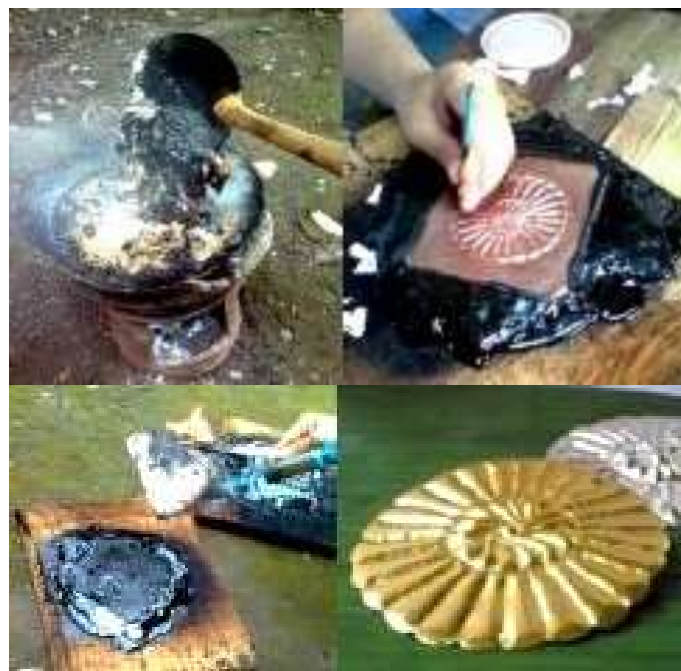
Figure 9: Chasing & Repoussé Process

Repoussé is a metal working technique in which a malleable metal is ornamented or shaped by hammering from the reverse side. Chasing is the opposite technique to repoussé, and the two are used in conjunction to create a finished piece. It is also known as embossing. This technique was founded in ancient time at religious object, weapons and tools with material iron and bronze. Geometrical designs as imagery of birds, animals and people who depicted them was founded at this object.