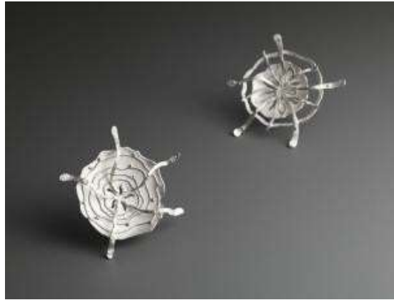
Work 3: Tropical Giant Flower I, II Brooch, 78mm x 78mm x 12mm, 72mm x 72mm x 15mm, 95% silver.

This work is transforming the shape into two designs. I put granulations as a depiction of dews and thin wire to express the wavy line of tropical forms.