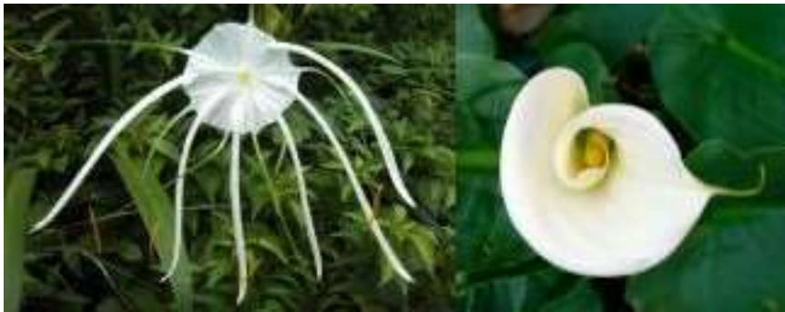
Figure 5: Tropical Giant Flower & Lily Flower (Source: private collection, 2009)

The character of Indonesian flowers is colorful, variety in texture, as we see at the surface of flower (soft, hard and sometimes like plastic) and had some pattern in their surface. They had various shape from the shoot flower until they are blossom, such as pitcher, trumpet, bowl, sun, bird, etc.