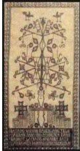
Figure 2: Banyan Tree Relief at Pawon Temple

In another Indonesia mythology, all species of bird are representing upper world. As we know, the upper world is a depiction of supernatural world, spirituals world, gods, sky and heaven. Until now Dayak tribe believe that hornbill is used as a conductor (vehicle) of their ancestor or as a depiction of their ancestor who fly to heaven, and as a symbol of loyalty. There is also a mythical bird that represents bravery and heroism. The bird is called garuda. In Hindu's faith, Garuda was a vehicle of Visnu (Hindu's God); therefore, Garuda is known as a supernatural and sacred bird. Garuda also is use as Indonesia nation symbol.