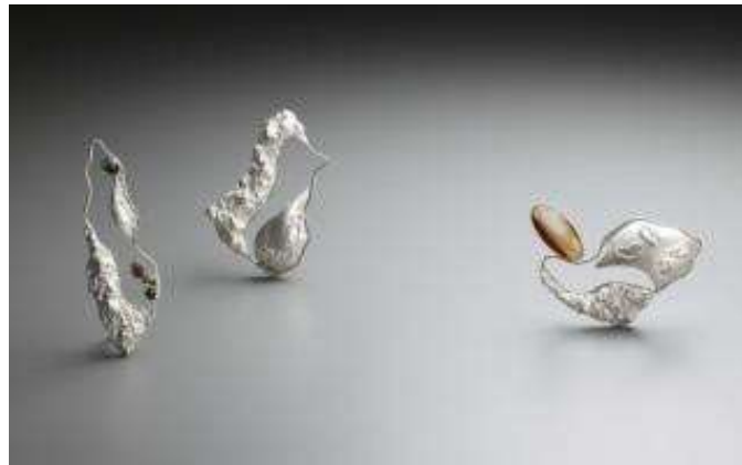
Work 4: The Island I, II, III Brooch, 30mm x 85mm x 18mm, 75mm x 52mm x 20mm, 48mm x 70mm x 20mm, 60mm x 50mm x 20mm, 92.5% silver, agate, tourmaline.

This work is transforming the shape into two designs. I put granulations as a depiction of dews and thin wire to express the wavy line of tropical forms.