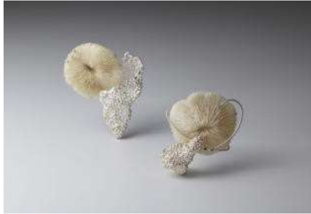
Work 6: Under the Sea 2 Brooch 75mm x 85mm x 28mm, 90mm x 75mm x 28mm, 92.5% Silver, Coral, Cubic, Blue Sapphire.

I'm doing some material explorations and finally I used mesh wax to get the coral reefs texture. First time I make the abstract shape with paper clay and put the mesh wax sheet onto the paper clay surface.