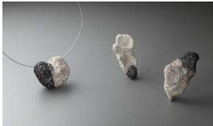
Work 5: Under the Sea 1, Pendant 60mm x 45mm x 30mm, Brooch 93mm x 50mm x 40mm, 85mm x 42mm x 30mm, Silver, Copper.

My country is surrounded by sea. Every island has a different shape and also had many varieties of land structure. The texture of each island, I make it with hard wax and shape the other land area with hydraulic press. The decoration I use thin wire, granulations and local stone that attach into silver plate.