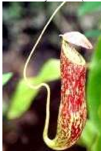
Figure 6: Pitcher Plant Flower