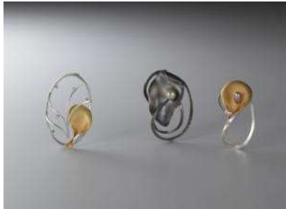
Work 1: Caladium Leaves I, II, III Brooch, 57mm x 28mm x 17mm, 60mm x 40mm x 15mm, 62mm x 40mm x 12mm, 92.5% silver, cubic, pearl, baroque pearl

The wave of caladium leaf and tree branches that interlock one another was generating a new image in my eye. From this experience, I transformed it into sketch book and make some modelling with soft clay. After that I shape my first work with silver plate and hammering technique.