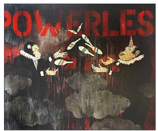
Figure 4: Samsudin Wahab "Powerless" , 2008, Mix Media on Canvas, 83 cm x 152 cm.

In reading an artwork, the application of Edmund Feldman theory is one of the methods for the best visual image reading. Referring to the artwork entitled " Powerless ", in the method of art description, the artist uses word image " POWERLESS " as the background, as well as two monkeys from the chimpanzee species which are playing seven " juggles ". The artist portrays the chimpanzees in formal