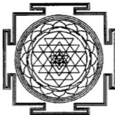
Figure 2: Mandala Triangular Art

Mandala art is one of the therapy forms to reduce stress. Thus mandala art also plays with the variety of forms, but the basic mandala comes from geometric figures. The symbol and the meaning are a remaining perpetual challenge to the thought and feelings. Plus, Carl Jung also mentions that drawing as a symbolic of wholeness and the expression of self-trauma. It was constructed by the human mind too. Some of the symbolism also brings the meaning to the artwork.