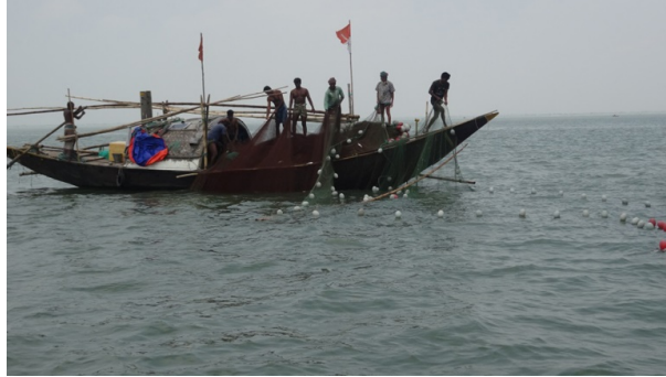
Plate 4:

Bangladesh, with its rich inland waters and river systems, has significant fishery and aquaculture potential. The favorable geographic position of Bangladesh comes with a large number of aquatic species and provides plenty of resources to support fisheries potential. Fish is a popular complement to rice in the national diet, giving rise to the adage Maache-Bhate Bangali (“a Bengali is made of fish and rice”) (Shamsuzzaman et al., 2017).