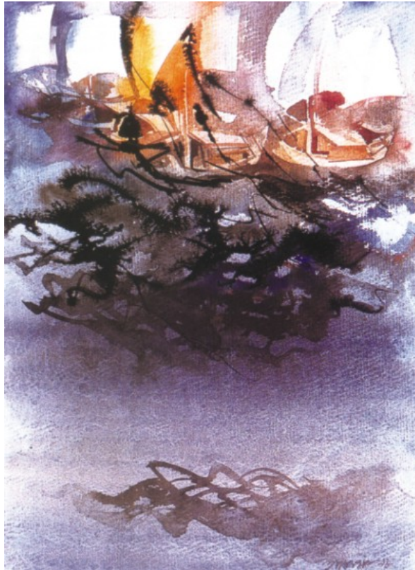
Plate 2: Boats and River, Water Colour, 110x90cm, 1998

Country boat is one in all of the commonly used water transportations in inland water transport, and fishes were another source of income for people in Bangladesh, Hashem Khan has reconstructed boats and fishes in his canvases. He was also the follower of folk art in Bangladesh. He has reconstructed the varieties of bird in folk motifs (Osman, 2000, p.113).