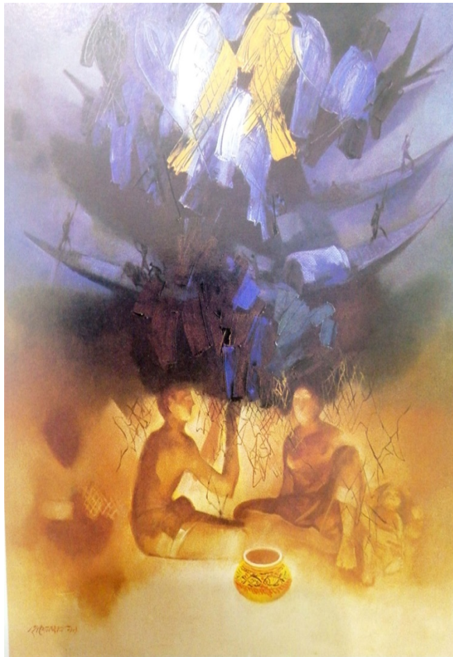
Plate 5: Fishermen with Net, Oil Colour, 112 cm x 90 cm, 1999 From Mamoon, M. (ED.), (2000) Hashem Khan , Dhaka: Bangladesh Shilpokala Academy.

Bangladesh, with its rich inland waters and river systems, has significant fishery and aquaculture potential. The favorable geographic position of Bangladesh comes with a large number of aquatic species and provides plenty of resources to support fisheries potential. Fish is a popular complement to rice in the national diet, giving rise to the adage Maache-Bhate Bangali (“a Bengali is made of fish and rice”) (Shamsuzzaman et al., 2017).