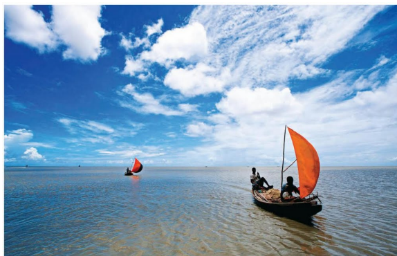
Plate: 3

Country boat is one in all of the commonly used water transportations in inland water transport, and fishes were another source of income for people in Bangladesh, Hashem Khan has reconstructed boats and fishes in his canvases. He was also the follower of folk art in Bangladesh. He has reconstructed the varieties of bird in folk motifs (Osman, 2000, p.113).