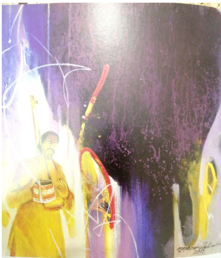
Plate 6: Acrylic on Paper, 61cm x61 cm, 2012

In this painting, Khan has used modest usages of symbolism. The painted pot is a traditional symbol for Bengali. The fishes and net are depicted as the prosperous and simplified lifestyle of common Bangladeshi people.