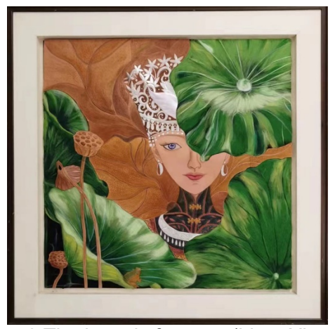
Plate 2 The lotus is fragrant (LiangXian, 2021)

Although traditional techniques are the starting point of contemporary national fibre art techniques, the creation around the design idea is inseparable from flexibility. The innovative change of traditional techniques is more conducive to the unique artistic charm of the works. "Fiber art constantly enriches and expands its own field. The unique structure, changeable form, spatial framework, and application of flexible ready-made products of fibre material make it present unique creativity and huge development potential in contemporary art creation, and also form an important force in contemporary art creation" (Shi& Huang, 2013).