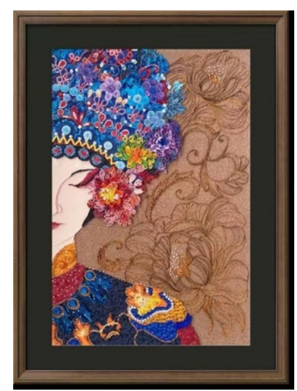
Plate 5 The Flower of the Nation (Feiling Xing, LiangXian, Shaomei Shao, 2021)