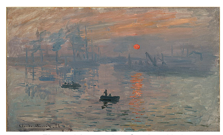
Figure 2 Impression, Sunrise, 1873

In his middle age, Monet was the backbone of Impressionism. In 1874, Monet showed a seascape for the first time at a Paris exhibition, but it was widely mocked. To mock painters like Monet, a critic called them "Impressionists". To show his resistance, Monet named his painting "Impression, Sunrise", which became known as Impressionism, and soon after, he became the leader of the painting school.