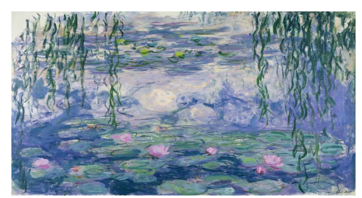
Figure 4 Water Lily series

Monet once confessed to a studio visitor: "It took me a little while to get to know my water lilies. I started purely for the pleasure of the eye and never thought to record them with a paintbrush. However, the landscape gradually became ingrained in my bones. It was as if I had a sudden awakening and realized the beauty of the lily pond in front of me, so I picked up my palette and painted. From that moment on, I painted almost nothing new."