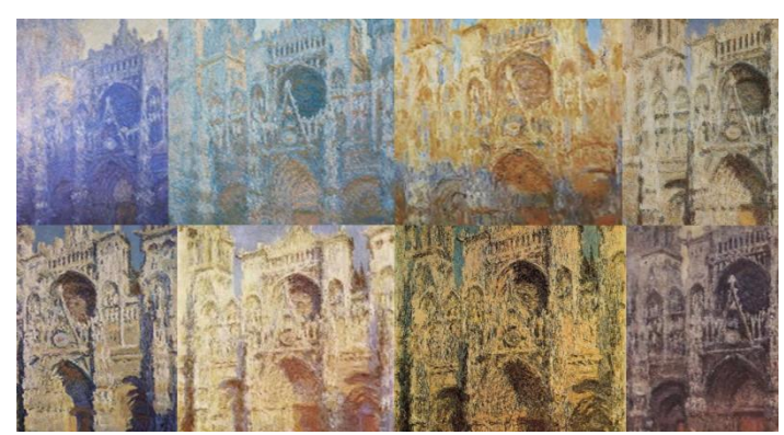
Figure 3 Rouen Cathedral series

Monet started his Rouen Cathedral series in February 1892, following the classic works of the Haystack series in 1888 and the Poplar series in June 1891. Rouen Cathedral, located in the city of Rouen in Normandy, France, is a medieval Gothic masterpiece that has stood for centuries as a symbol of religious piety and architectural brilliance. During a visit to Rouen in 1892, Monet was fascinated by the interaction of light on the facade of the church building, which inspired him to create more than 30 paintings.