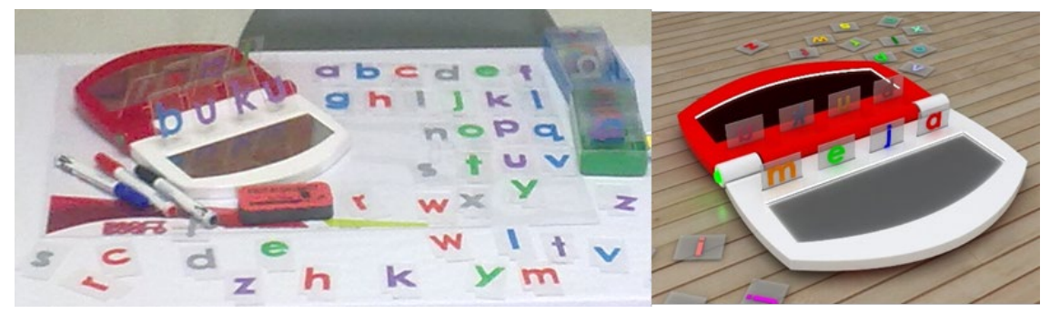
Figure 7 Prototype and final design of teaching aid for dyslexic children

The developed prototype for a teaching aid for dyslexic children incorporates multisensory elements, interactivity, and personalized learning options to effectively support their learning process. Figure 7 represents the prototype and final design of teaching aid for dyslexic children