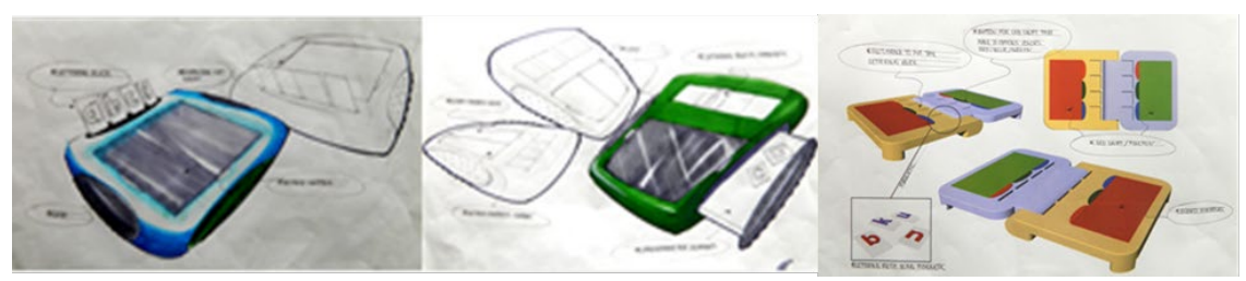
Figure 2 The Idea Development Stage

Figure 2 shows the concept refinements from the selected designs. Concept refinement is a crucial step in the design process where selected ideas or concepts are further developed, improved, and iterated upon. It involves analyzing and refining the chosen designs to enhance their feasibility, functionality, aesthetics, and overall effectiveness.