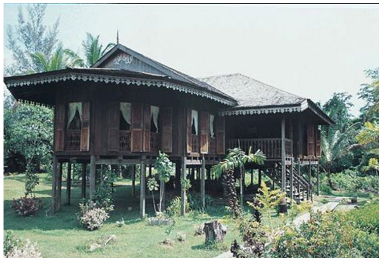
Figure 2 Example of The Malay timber houses of Kelantan.