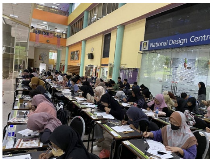
Picture 5 Finishing the task giving

The method of assigning tasks was chosen to implement learning to write Naskhi calligraphy.