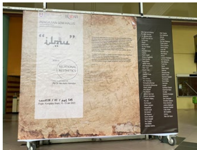
Picture 1 banner on the program

In the implementation of mentoring activities, the art of writing calligraphy uses several methods.