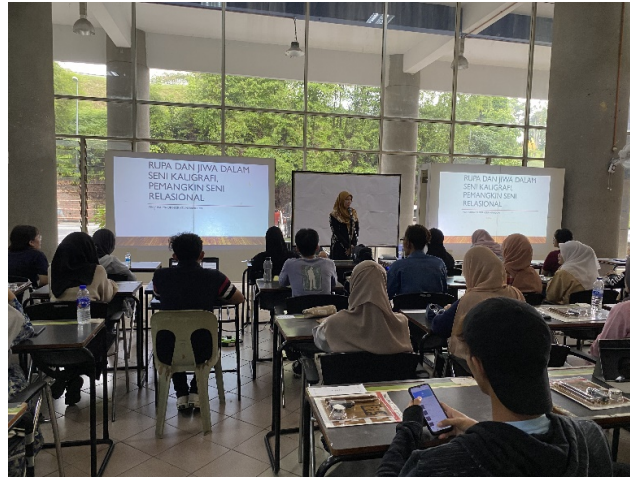
Picture 2 Lecture on the Khat Calligraphy