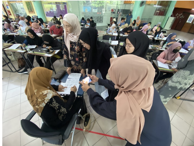
Picture 4 One by one training