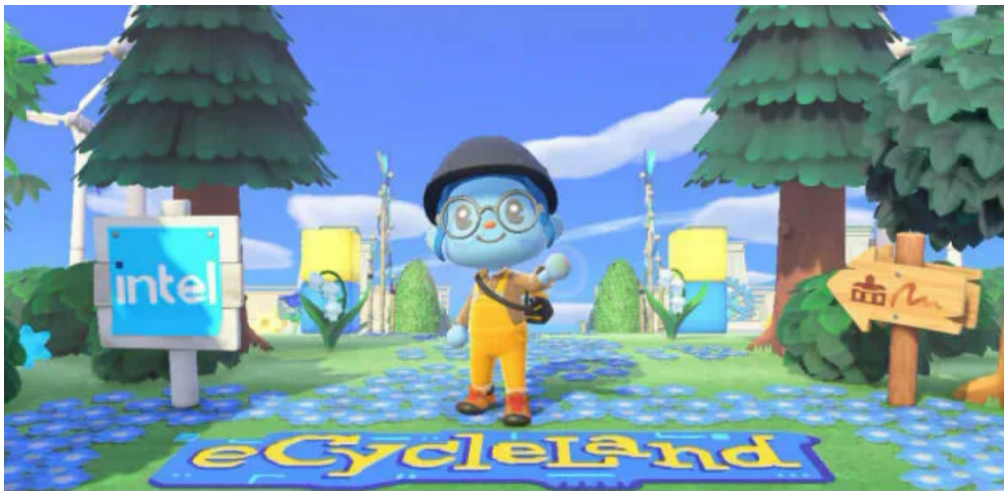
Image 4 Digital recycling game to educate consumers on e-waste.

to increase audience motivation to be part of the recycling habit solution (Santti et al., 2020). Implementing strategies and continuously refining approaches based on user feedback and emerging technologies can create effective tools for motivating and educating people about recycling and environmental conservation.