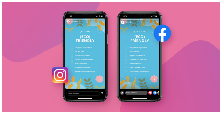
Image 3 Recycle Campaign content in different social media platform.

In today's rapidly changing world, responsible parties must ensure accurate and tailored information to meet diverse audience needs, enhancing communication effectiveness and building trust and positive relationships, especially in an interconnected world.