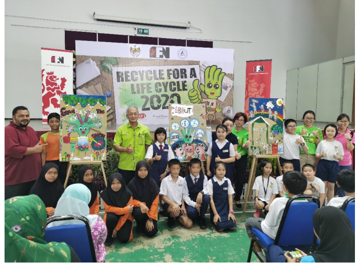
Image 1 Recycle campaign conducted amongst school children.