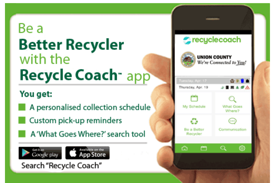
Image 5 Recycle Coach Apps – Free educational recycle mobile apps.

The audience's perception in these varying recycle campaign types and platform is critical to its success. By understanding and addressing the factors that can influence perception, the campaign can be designed to effectively engage and motivate the audience to participate in recycling behaviours. Adaptability and responsiveness are crucial for long-term success, as audience perceptions and behaviors may change over time.