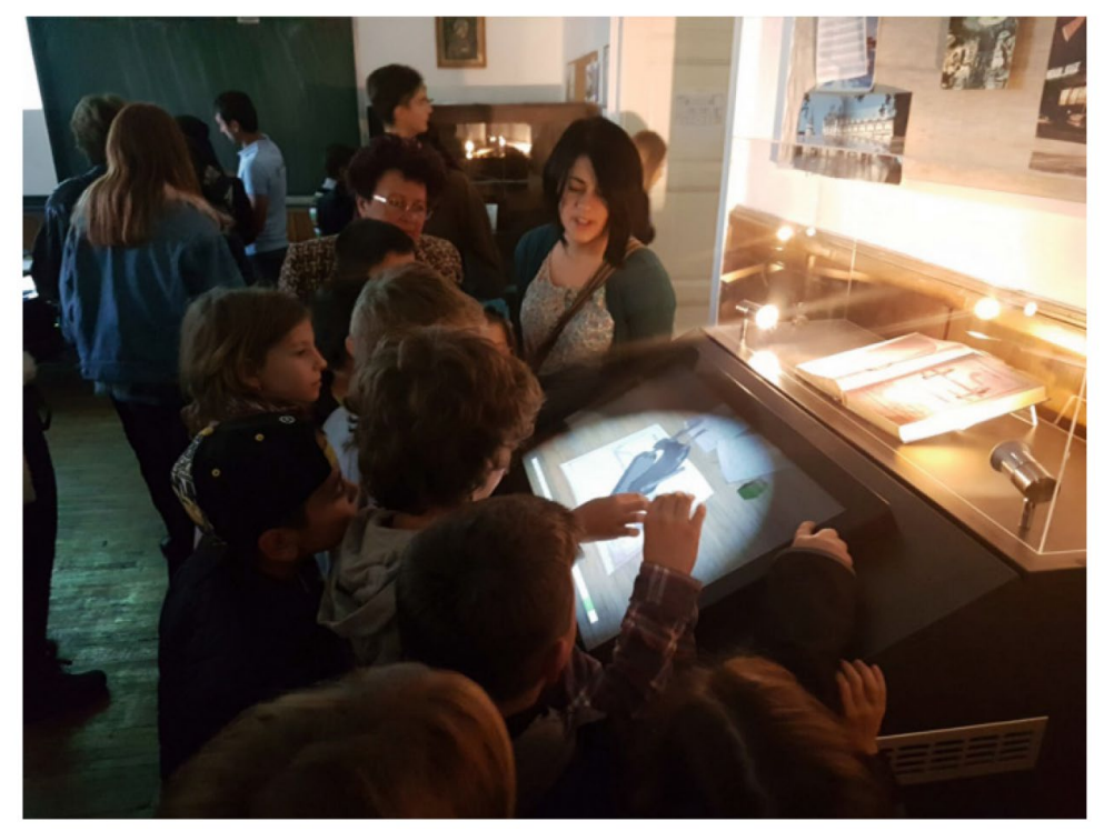
Figure 2 A 3D-augmented book titled Constitutio Criminalis Theresiana (Nemesis Theresiana).

Modern approaches such as interaction design incorporation, interactive storytelling, and artificial intelligence could direct a new paradigm for museum experience design (Dal Falco & Vassos 2017; Vermeeren et al., 2018; Harada et al., 2018). The use of human-computer interaction for museum artifacts can offer a unique interactive and storytelling experience (Zidianakis et al., 2022; Benko et al., 2016). When AR replicas were visualized in real time, visitors could interpret historical figures through narrative-based setups (Rizvić et al. (2021). This study agrees that augmented museum exhibitions together with supplementary information could contribute to creation of an 'animated archive of cultural materials' (Patti, 2020) (refer to Figure 2). In the same vein, this initiative could catalogue objects alongside their descriptions and identify multiple representations of the same artifact.