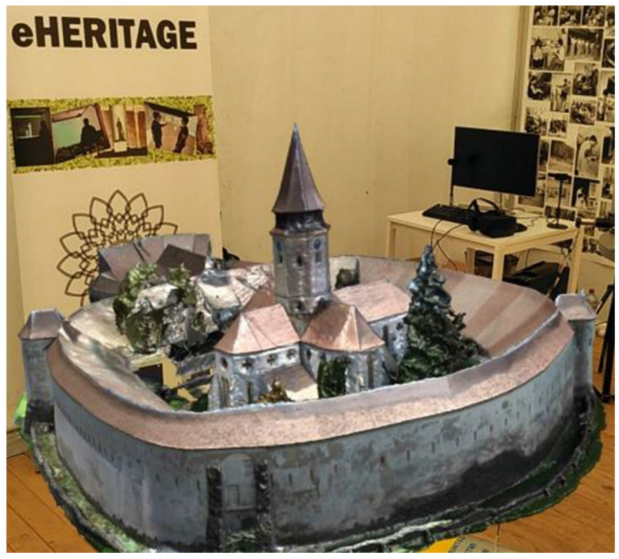
Figure 3 The example of 3D reconstructed Prejmer Fortified Church, a UNESCO monument from Transylvania, Romania.

For instance, AR is applied in the restoration of damaged sacred objects, contributing to the rejuvenation of these culturally significant heritage artifacts (Boboc et al., 2017). It aids in determining the most effective restoration strategy to create a precise replica, thereby reducing costs and expediting the restoration process. Through the use of 3D reconstruction technology, a digital model of the damaged object can be generated (Parfenov et al., 2022) (refer to Figure 3). Subsequently, the optimal restoration strategy is identified by implementing an AR application developed based on this digital model (Abate et al., 2018; Blanco-Pons et al., 2019). Despite its advantages, augmented reality technology encounters challenge due to the lack of clear guidelines on its utilization. Another substantial obstacle to the widespread adoption of AR technology in the reconstruction process is the limited experience with AR applications.