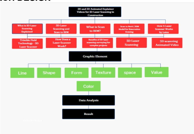
Figure 1 Research Process

This research was designed to investigate how graphic elements in both 2D, and 3D animated videos contributed to the explanation of 3D laser scanning in the context of construction. To achieve this, a diverse selection of animated videos related to 3D laser scanning in construction was gathered for analysis. The primary focus of the study was on identifying and categorizing graphic elements, such as line, shape, form, texture, space, value, and colour used in these videos. A systematic content analysis approach was employed, wherein each video was carefully watched, and observations regarding the types of graphics utilized were recorded. These observations were then categorized based on their purpose, clarity, and overall effectiveness in conveying information about 3D laser scanning.